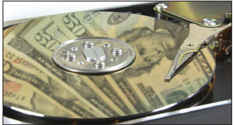
Common Causes of Data Loss

Backups can be automatically and securely executed on a daily basis or even up to the minute with our continuous replication technology. After the initial backup, only changes to your files are backed up - allowing for quick and effective transmissions to our secure data center.